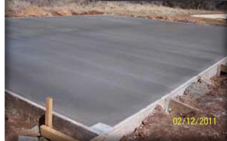
Concrete was poured for pavillion and horse wash yesterday.