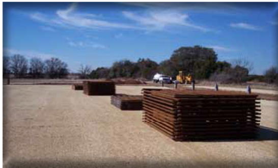
Horse pens have been delivered and will soon be in place.