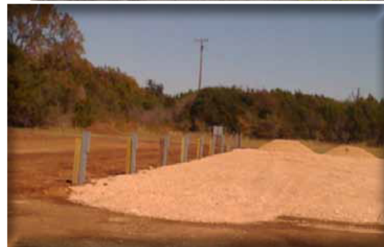
New Electrical & Water Hookups