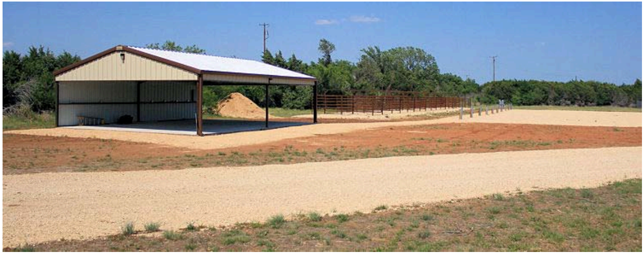
Reynolds Creek Equestrian Campground and Trail Head. Reynolds Creek Park, Waco Lake, Texas